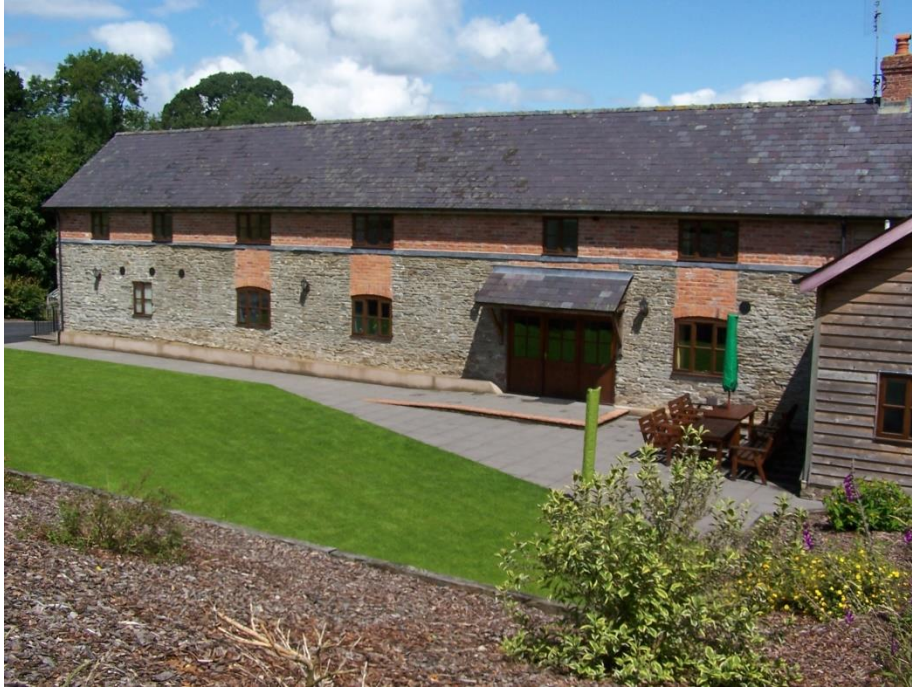
Orchard House front entrance ramp