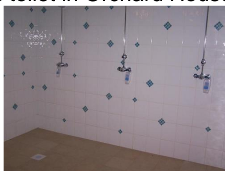
Pool Barn wet room shower area