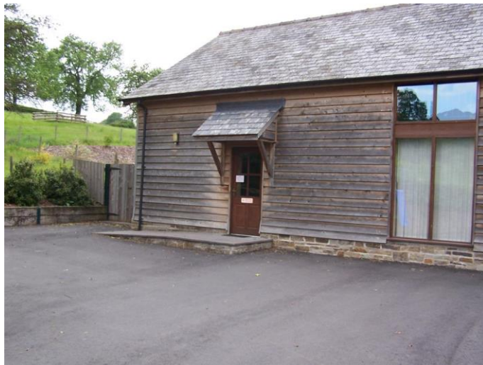
Pool Barn entrance ramp