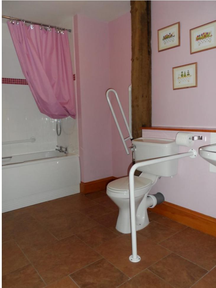
Orchard House ground floor bedroom ensuite bathroom